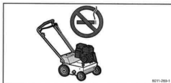
Smoking near the machine is strictly prohibited.