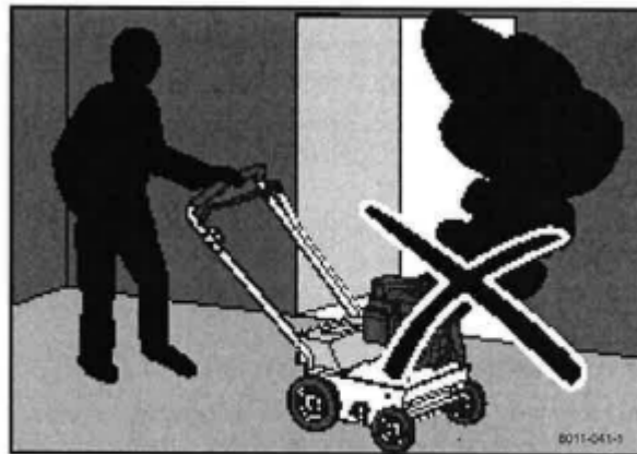
The engine exhaust is poisonous. Never run the engine indoors.

ENGINE EXHAUST, SOME OF ITS CONSTITUENTS AND CERTAIN VEHICLE COMPONENTS CONTAIN OR EMIT CHEMICALS CONSIDERED TO CAUSE CANCER, BIRTH DEFECTS OR OTHER REPRODUCTIVE HARM. THE ENGINE EMITS CARBON MONOXIDE, WHICH IS A COLOURLESS, POISONOUS GAS. DO NOT USE THE MACHINE IN ENCLOSED SPACES.