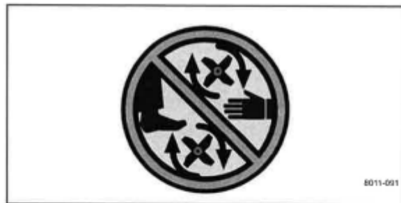
Keep your hands and feet away from moving parts.